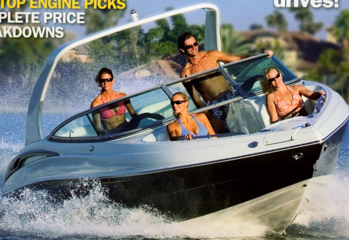
Caravelle 267 LS

+ WHY DO THEY DO THAT? THE HULL TRUTH P21 18 KEY QUESTIONS YOU NEED TO ASK