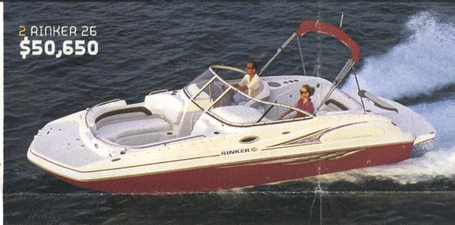
2 RINKER 26 $50,650