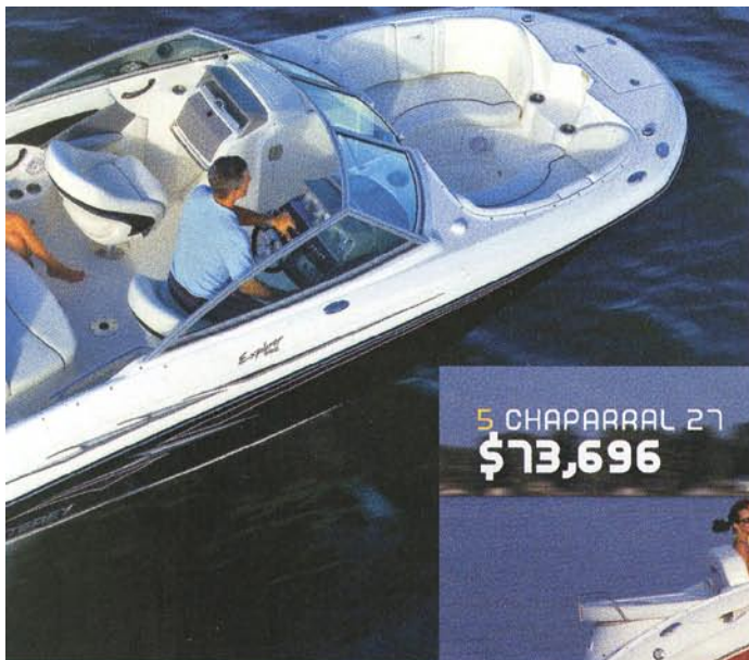
5 CHAPARRAL 27 $73,696