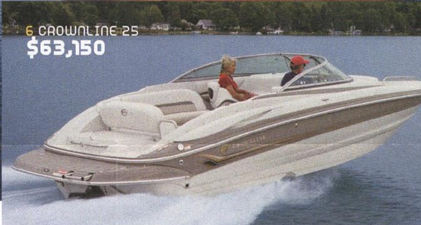
6 CROWNLINE 25 $63,150